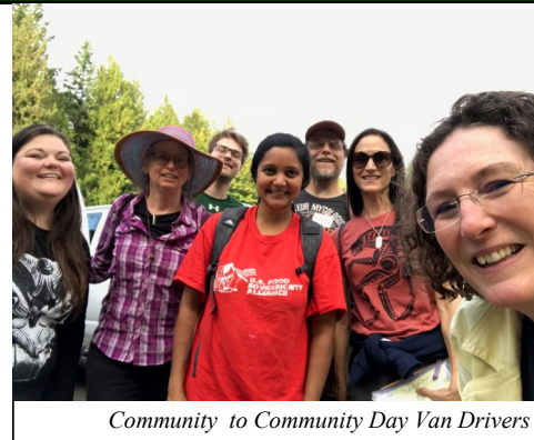
Community to Community Day Van Drivers

"It opened my mind to the community around me." - student participant