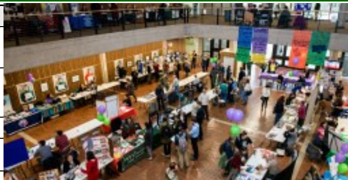
Community Opportunities Fair 2016