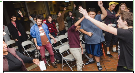
Gateways Open Mic Fall 2015

WA Campus Compact CAC AmeriCorps members report 55 Evergreen students served 3,300 hours as academic mentors to 89 incarcerated youth at Green Hill School JJ&RA facility and group homes. The Gateways College Class brings 20 Evergreen students to Green Hill School to work collaboratively in a seminar-style learning environment with 13 incarcerated youth who earned college credit in fall and winter. Mentoring was supported by Thurston County Community Investment Partnership (CIP).