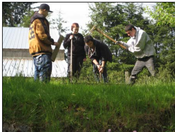
Evergreen Student Action Day with GRuB Youth at CIELO Project spring 2012

89 students served at 14 organization sites for C2C Day of Caring 2011.