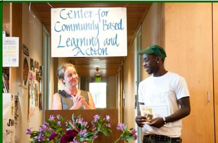
CCBLA Student Recognition Event May, 2012

Another way we tell our story is through our Annual Student Recognition Event held each May which includes student testimonies about their growth and transformation through hands-on learning in the community. The event highlights how students learn about real, pressing community needs, and find roles in local organizations that are addressing those needs. We also hear from community partners who serve as mentors, coaches, guides, field supervisors and teachers for Evergreen students. Faculty give insights into involving students in deep inquiry and reflection about their learning with community. Our CCBLA AmeriCorps and Student staff guide the event with grace and enthusiasm.