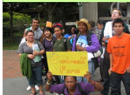
New Student Orientation Service Day 2011 First Peoples' Scholars go to Sunbreak Farm

Olympia Free Clinic Olympia Free Herbal Clinic Olympia Seed Exchange Olympic Middle School Out of the Woods Shelter People for Puget Sound Planned Parenthood POWER (Parents Organizing for Welfare and Economic Rights) Puget Sound Restoration Fund Rachel Corrie Foundation River Ridge High School ROOF SafePlace SeaTrust Institute South Sound Beach Naturalist Sound Experience Sound Learning South of the Sound Community Farm Land Trust South Sound High School South Puget Sound Salmon Enhancement South Sound Seniors Stonewall Youth Sunbreak Farm Squaxin Island Canoe Journey Thurston County Bookends Thurston County TV (TCTV) Thurston County Volunteer Legal Services Thurston Conservation District Thurston Co. Food Bank-Gleaners Thurston County Syringe Exchange United Communities AIDS Network United Way of Thurston County USDA Wa He Lut Indian School Washington Middle School Washington State Coalition Against Domestic Violence Crossing Borders Program WashPIRG Works In Progress Yes! Community Technology Center YouthBuild Yoyo Recordings YWCA Women's Resource Center