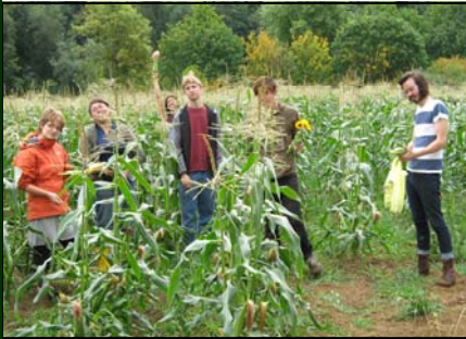
Students at Helsing Junction on Community to Community Day in September of 2008