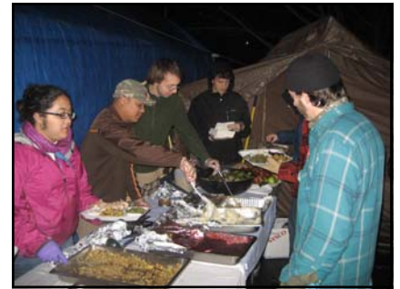
5 meals were organized this year with Evergreen students and Camp Quixote Residents preparing and sharing food together.