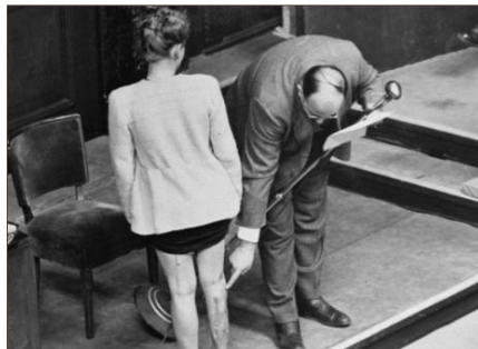
Nuremberg, Germany, 1946