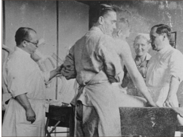
Nazi Physicians at Auschwitz camp, between 1941 and 1944

Nazi doctors and scientists conducted cruel, harmful, often lethal experiments on prisoners in war camps