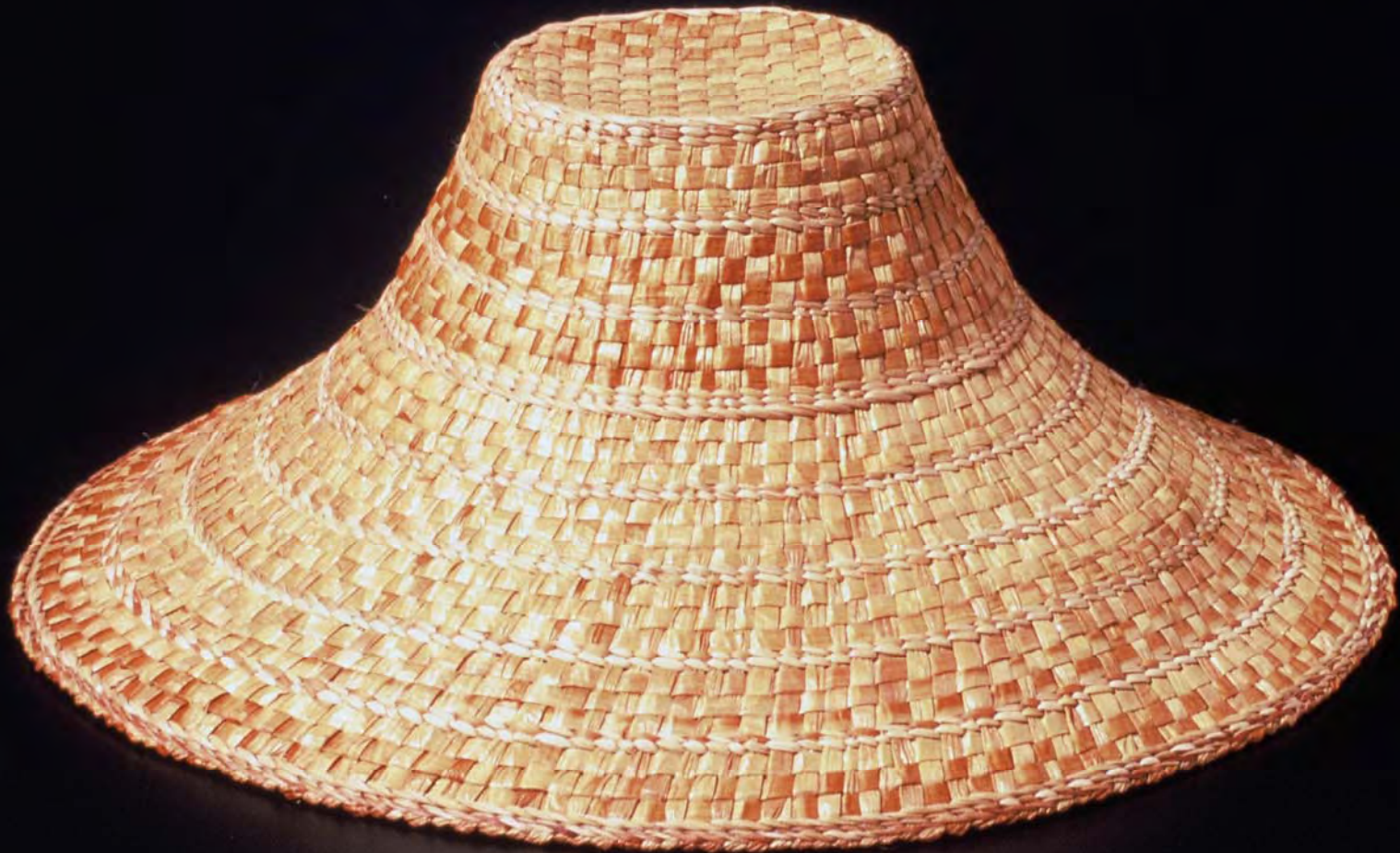
“Plaited Hat” Red and yellow cedar bark 5”W x 7”H 2009

Lisa Telford will teach 15 native students how to make a Plaited Cedar Hat in Seattle, Washington .