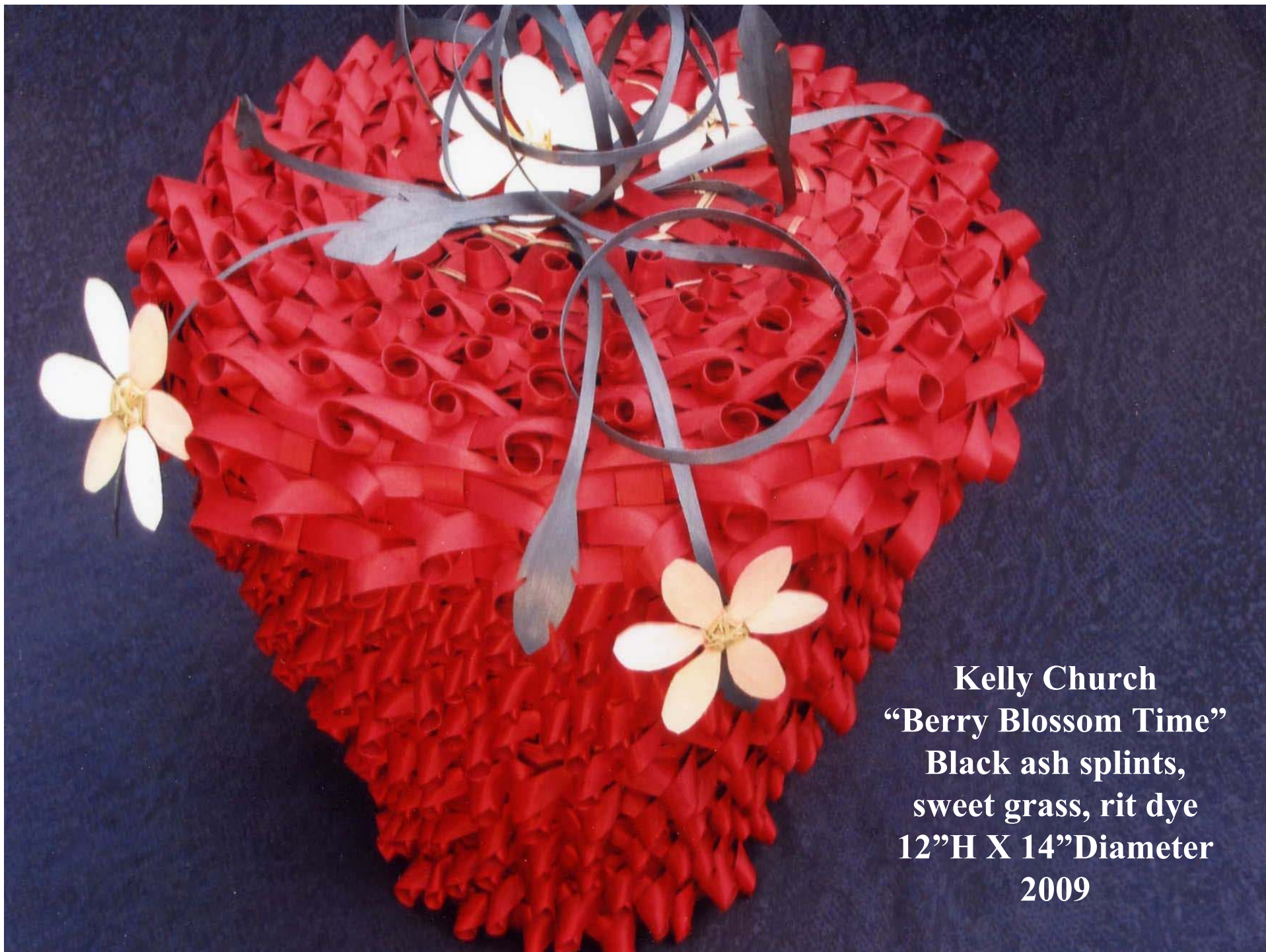
Kelly Church “Berry Blossom Time” Black ash splints, sweet grass, rit dye 12”H X 14”Diameter 2009