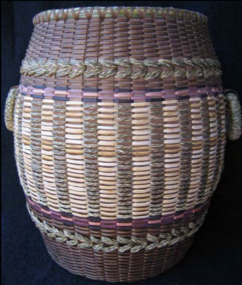
“Barrel Basket” Black ash, sweet grass, cedar bark, natural and commercial dye 12”H x 7”W 2008

Theresa Secord will research and teach basswood fiber preparation and traditional ash splint basketry in a 6-day intergenerational workshop on Indian Island of the Penobscot Nation.