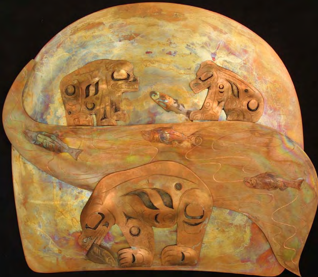
“Mother Bear” Copper 18 gauge 13” X 10” 2001