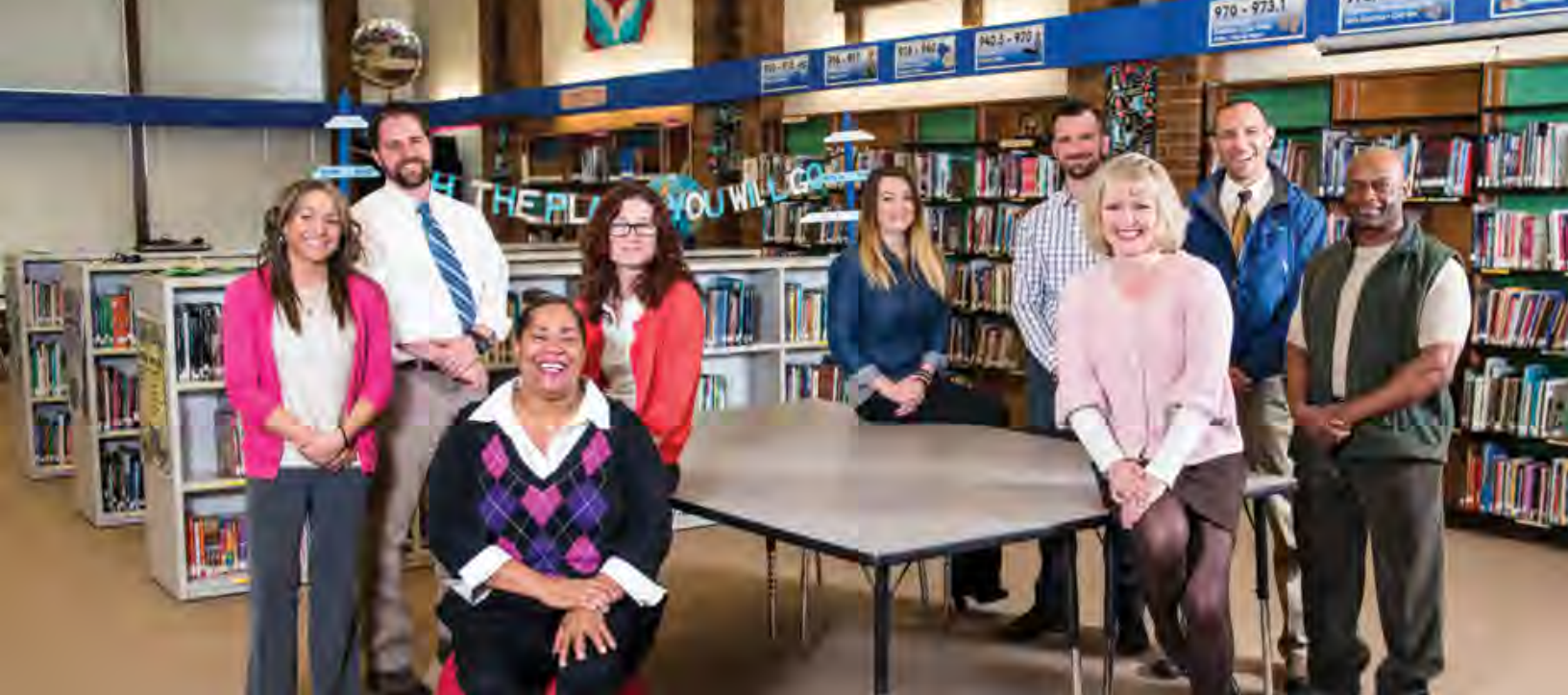
MiT graduates and student teachers at Lochburn Middle School in Lakewood.