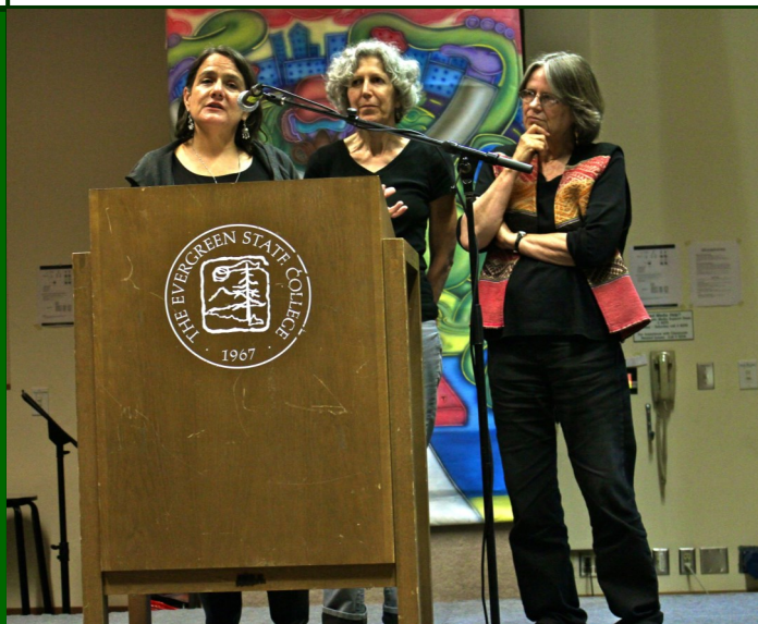
CCBLA Faculty Supporters Golden G*idqs Awards