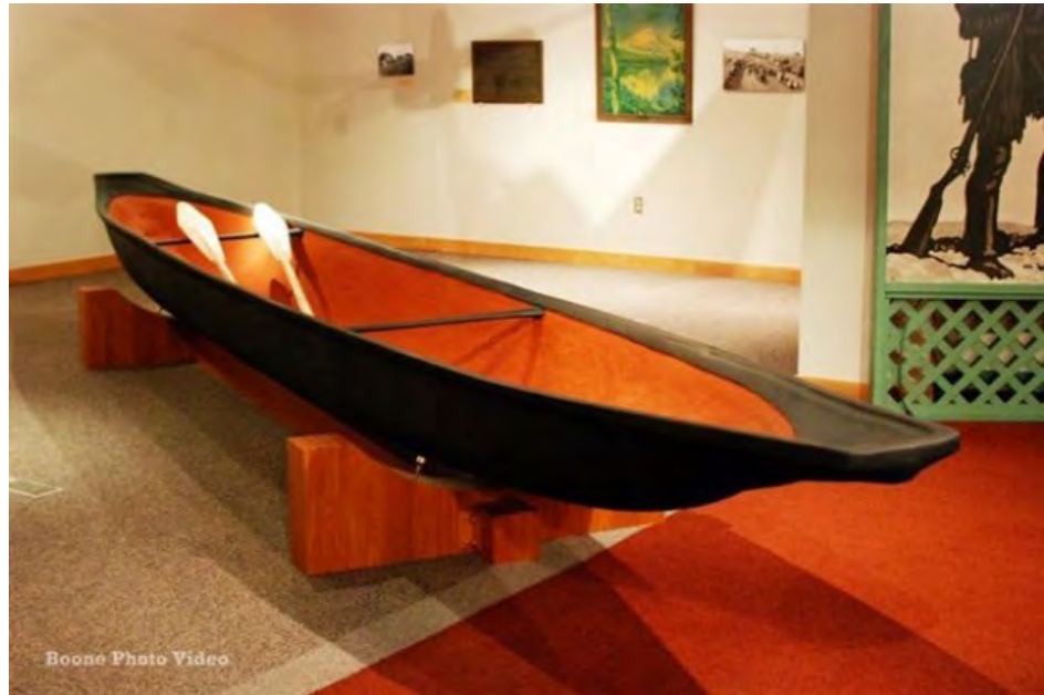
“Shovelnose River Canoe”

Will teach quarterly carving classes, in coordination with the Cowlitz tribe, and will purchase a portable saw mill.