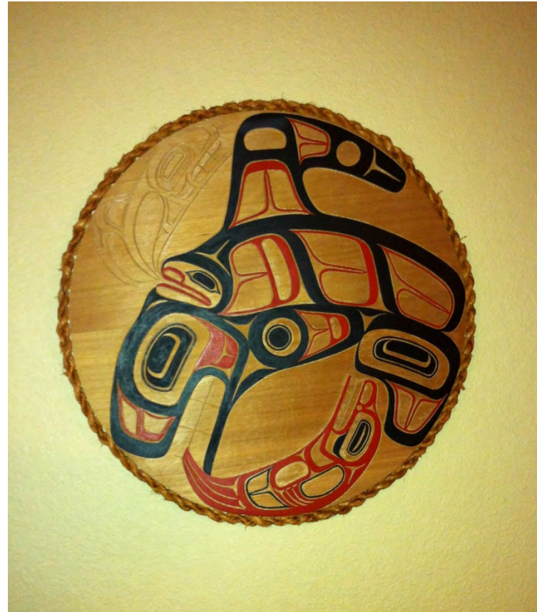
“Killerwhale and Seal Panel”

Purchase quality carving tools, old growth cedar and design elements to create a traditional red cedar moon mask inlaid with abalone and ivory, and wrapped with red cedar rope.