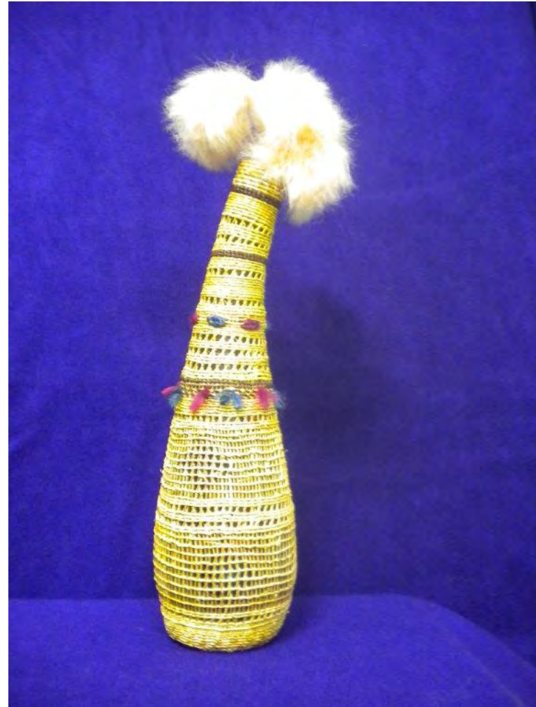
“Cotton on Rye”

Teach three two-day classes in traditional Alutiiq “open” weave technique using beach rye grass.