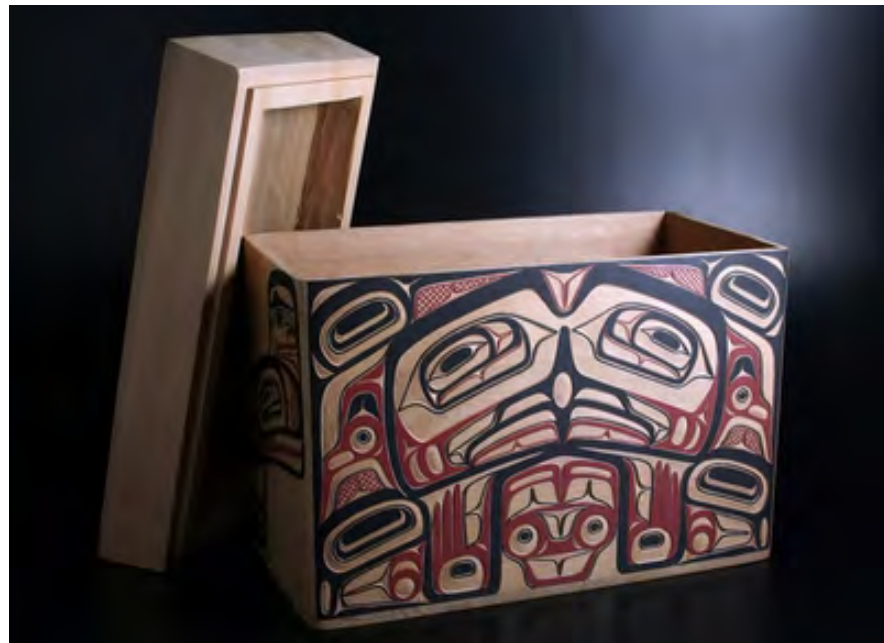
“Eagle Bentwood Box”

Hold a series of workshops to teach the ancient tradition of making bentwood boxes.