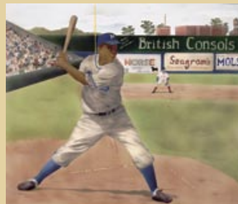
"Jackie Robinson, Montreal Royals, Delorimier Stadium, 1946," Fine Art Giclee Imaging on watercolor paper. (19"hx22"w)

The Evergreen State College Foundation 2700 Evergreen Parkway NW Olympia, WA 98505 360.867.6106 steELEMA@evergreen.edu